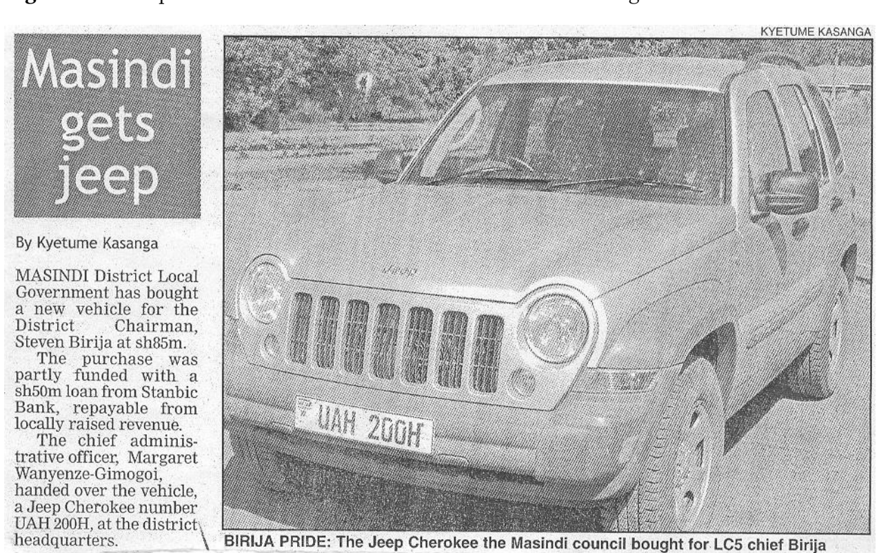
Figure 1.2: Transport Facilitation for Local Government Leaders in Uganda.