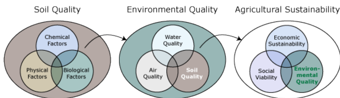
Figure 2. Ecosystem sustainability (Source: [27])

These domains overlap where agroecological, social, and economic processes interact (e.g., in determining the vulnerability of ecosystems to management strategies and the impacts of land degradation). Solid arrows represent links between factors that determine vulnerability and land degradation, dashed arrows represent potential links between vulnerability and land degradation (Source:[26]).